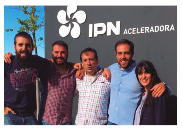
Instituto Pedro Nunes (Lisbon, Portugal)