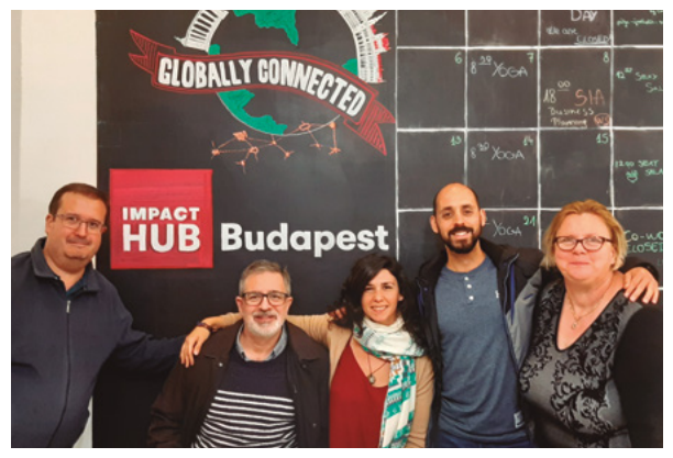
Impact Hub Budapest (Hungary)