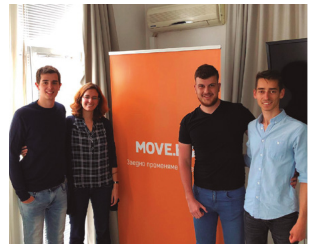
Start it Smart (Sofia, Bulgaria)