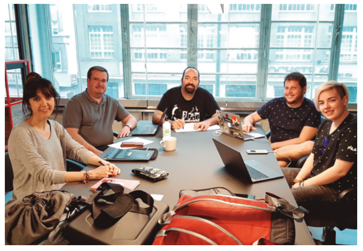
Betahaus (Berlin, Germany)