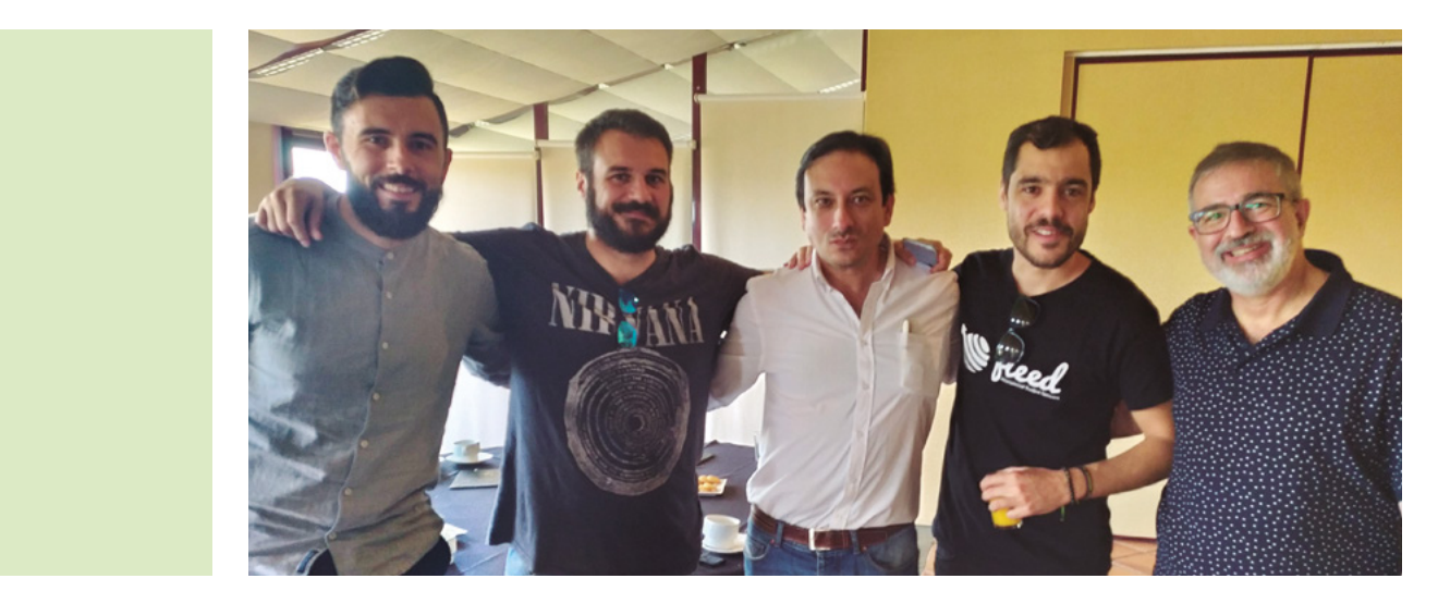
EU Mentors and entrepreneurs