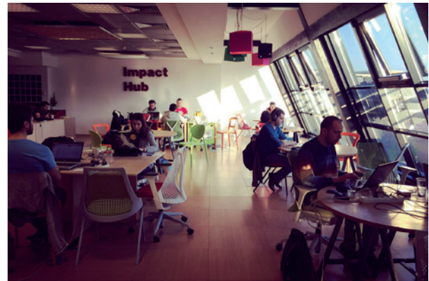
Impact Hub Budapest, Hungary