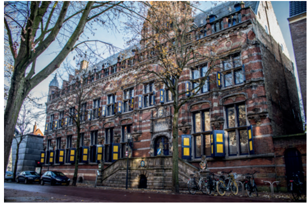
Stichting Business Development Friesland, Leeuwarden, The Netherlands (EBN Network)